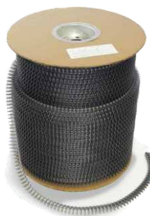
Cold-rolled steel clinch clips. Continuous roll, polycord collated

It uses collated metal clips that are fed into the tool's magazine from a continuous coil of clips mounted on a gantry.